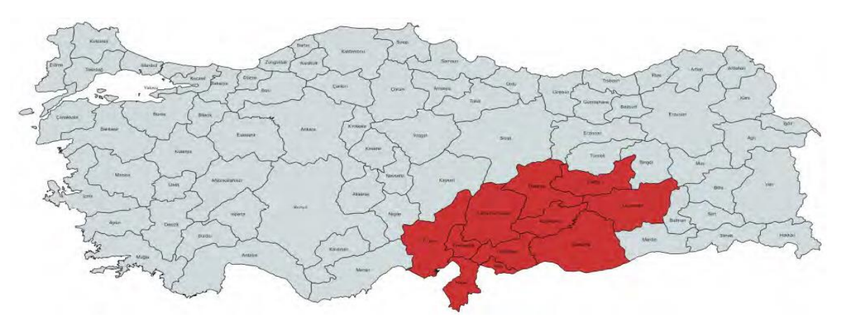
Figure 1. Provinces primarily affected by Kahramanmaraş earthquakes (AFAD, 2023; URL-6).

Republic of Turkey, Ministry of Interior, Disaster and Emergency Management Presidency (AFAD) On 06.02.2023, at 04:17 and 13:24, Turkey time, two earthquakes of magnitude Mw 7.7 and Mw 7.6, the epicentres of which were in Pazarcık (Kahramanmaraş) and Elbistan (Kahramanmaraş) stated to have occurred (Erol & Çekilme, 214). The earthquakes that occurred were close to the ground surface and the 7.7 Mw earthquake occurred at a depth of 8.6 km, while the 7.6 Mw earthquake occurred at a depth of 7 km. The closest settlement to the epicentre of the 7.7 Mw earthquake was Pazarcık/Akdemir (2.72 km), and the closest settlement to the epicentre of the 7.6 magnitude earthquake was Elbistan/Gümüsdöven (1.70 km). After the earthquakes that occurred, approximately 1300 aftershocks were recorded until 09.02.2023 at 16.00 and nearly 3000 aftershocks were recorded until 16.03.2023 at 24.00 (AFAD, 2023; ITU, 2023). Figure 1 shows the provinces that were primarily affected by the Kahramanmaraş-centered earthquakes.