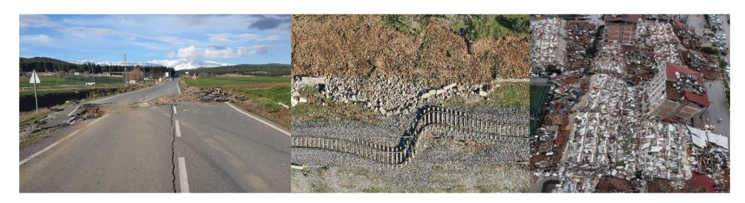
Figure 4. During the 06 February 2023 Pazarcık, Kahramanmaraş, Turkey earthquake, the 3 m offset on the highway and railway and the damage to the buildings can be seen in the region.

Although there is a separate seismicity for each province in the affected region after the Kahramanmaraş earthquakes that occurred in the Eastern Anatolian Fault Zone (EAFZ), large earthquakes that may occur in another region vary in terms of structure, ground, design, application, etc. It can affect a very wide area with multipliers. First of all, knowing the seismic activities in the region and their effects in the historical and instrumental process will shed light on the present and the future. Figure 4 shows the 3 m offset and damage to buildings on the highway and railway in the region during the Pazarcık earthquake of February 06, 2023. Existing figures provide important information about the intensity of the earthquake in the region. When the damages observed on the ground of the region with the Pazarcık earthquake are evaluated from a geotechnical point of view, the structure, lithology, thickness, underground water level, etc. When factors are evaluated with ground movement, they can directly affect structural damage.